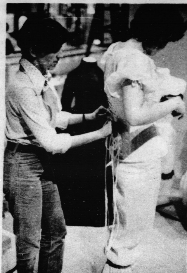
Figure-moulding underwear made it difficult to breathe and the complete Victorian summer outfit weighed an average of 10 lbs. Just how un-liberated women have been in their dress is shown in Fads and Fashion - The Great Put-On, part of "Summer '75 at the Science Centre".